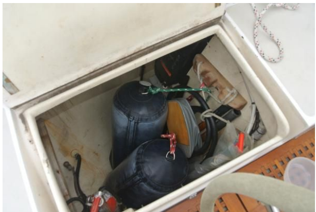
Bristol 45.5 Aft Cockpit