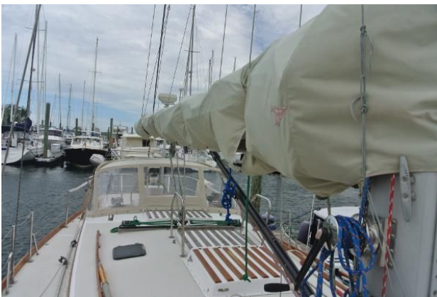
Bristol 45.5 Aft Cockpit