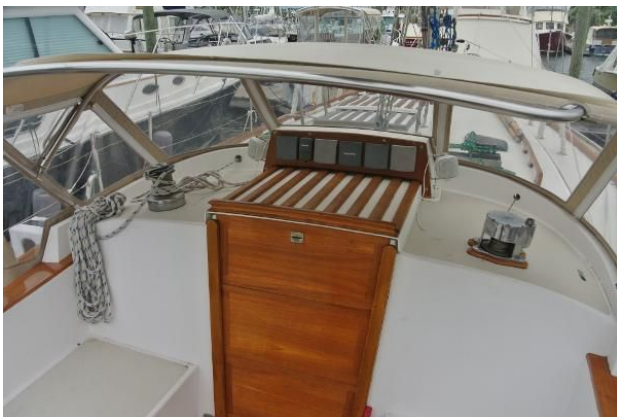
Bristol 45.5 Aft Cockpit