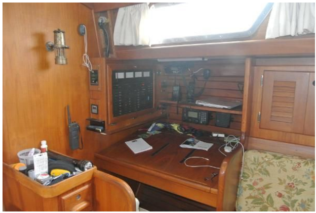
Bristol 45.5 Aft Cockpit