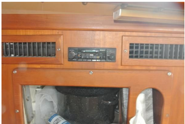
Bristol 45.5 Aft Cockpit