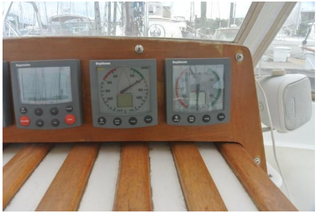
Bristol 45.5 Aft Cockpit