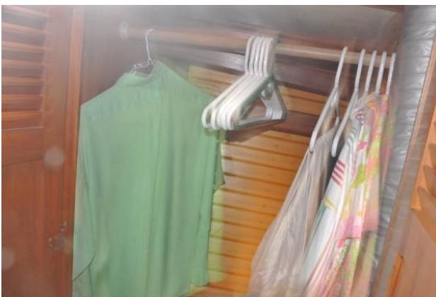
Bristol 45.5 Aft Cockpit