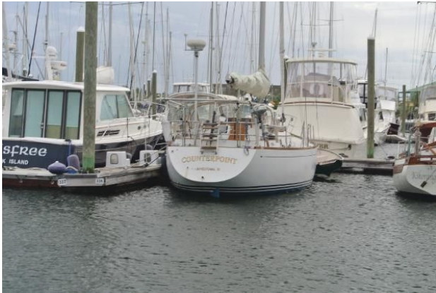
Bristol 45.5 Aft Cockpit