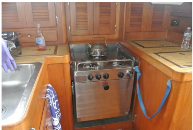
Bristol 45.5 Aft Cockpit