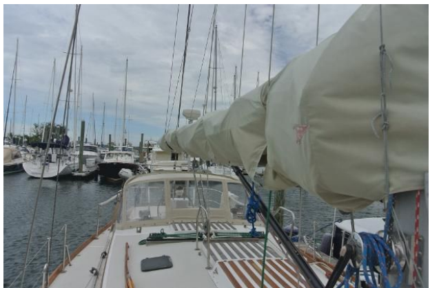
Bristol 45.5 Aft Cockpit