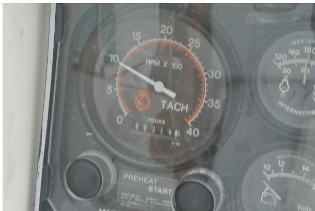
Bristol 45.5 Aft Cockpit