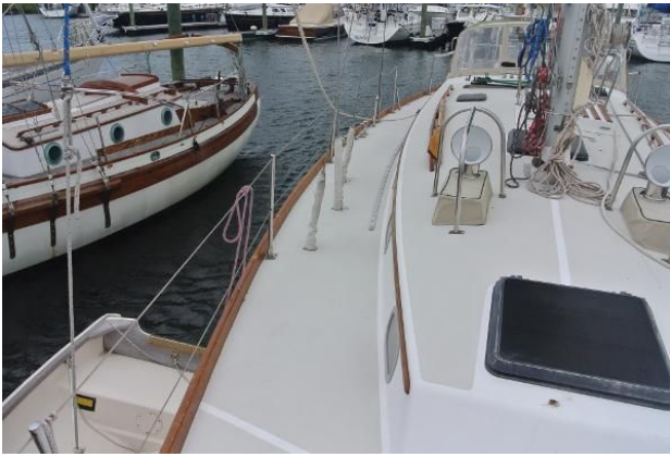
Bristol 45.5 Aft Cockpit