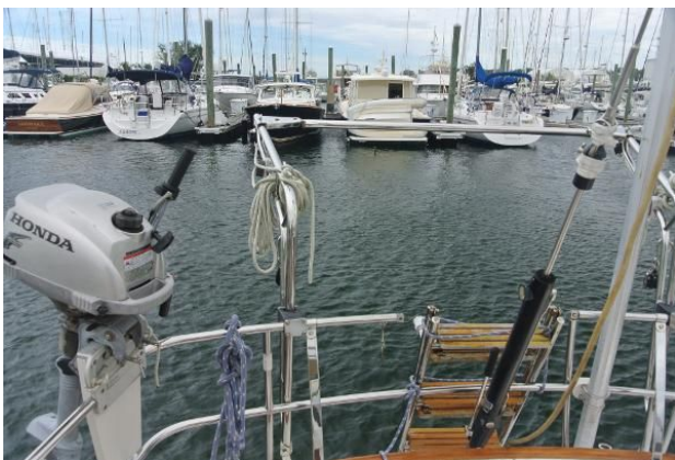
Bristol 45.5 Aft Cockpit