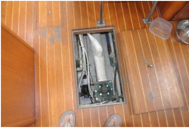
Bristol 45.5 Aft Cockpit