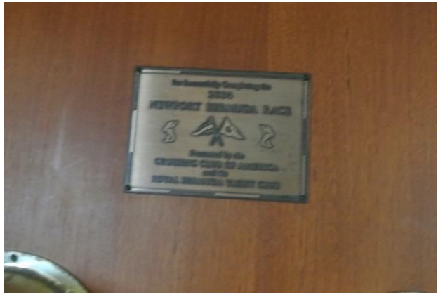
Bristol 45.5 Aft Cockpit