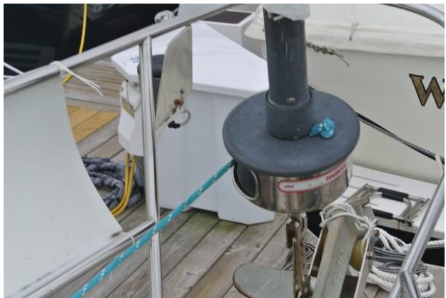
Bristol 45.5 Aft Cockpit