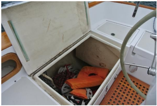
Bristol 45.5 Aft Cockpit