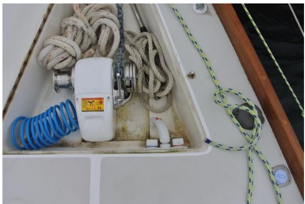
Bristol 45.5 Aft Cockpit