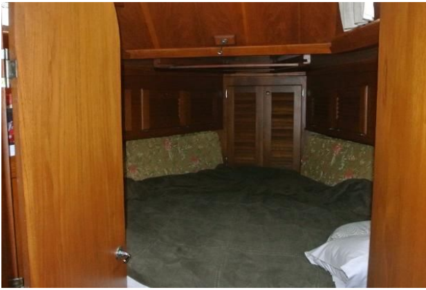
Bristol 45.5 Aft Cockpit