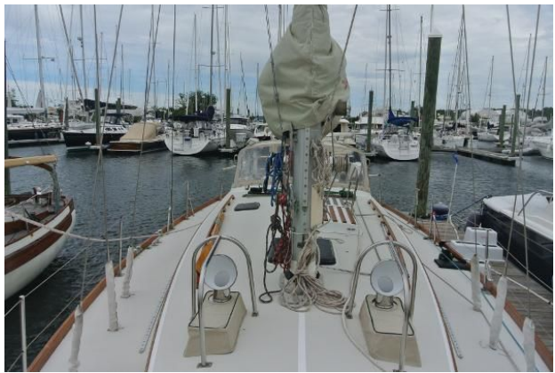
Bristol 45.5 Aft Cockpit